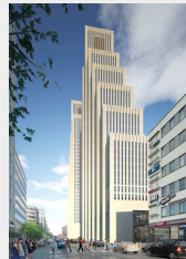
Innovation & Helix