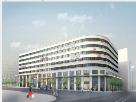
Torsplan 1 (NCC)