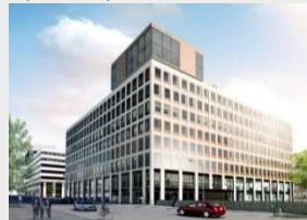
Torsplan 2 (NCC)