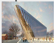
KI auditorium (NCC)